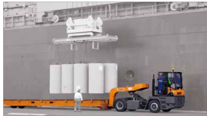
» Cargo trailer system with MAFI Tractor