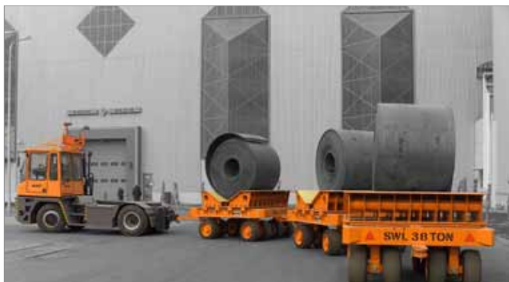
» Coil bed trailers with MAFI tractor