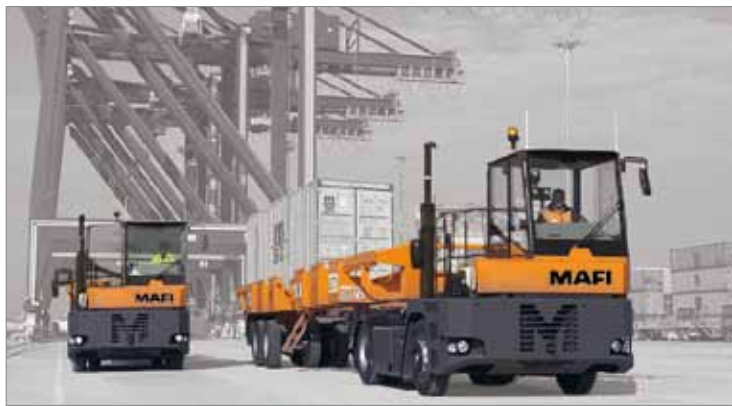
» Container chassis with MAFI tractor