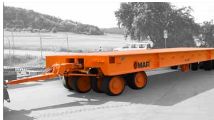
» Heavy-duty drawbar trailer