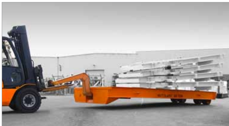
» Cargo trailer system with forklift truck