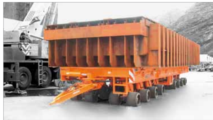
» Heavy-duty elevating trailer